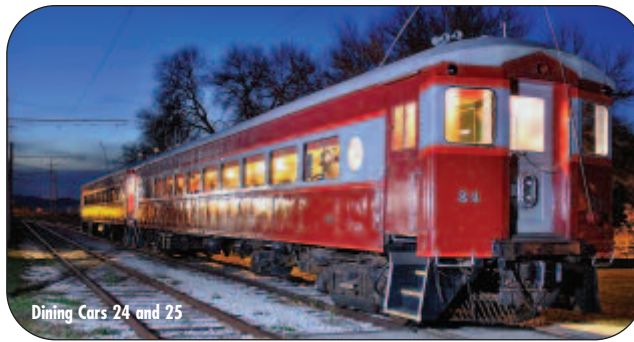
Dining Cars 24 and 25