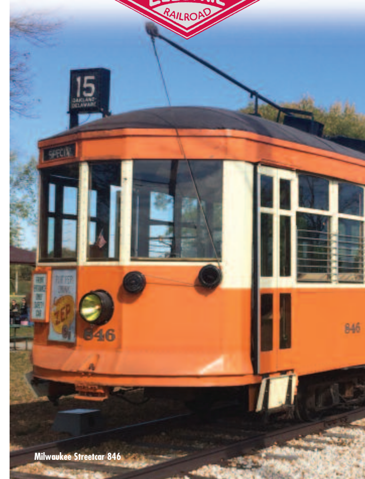
Milwaukee Streetcar 846